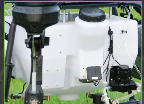
92L WATER TANK