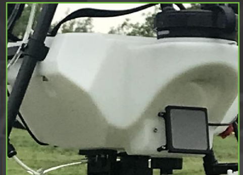
10L WATER TANK