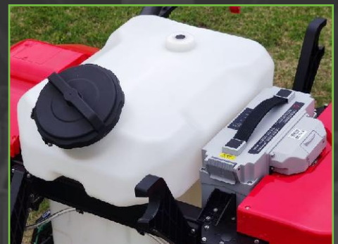
30L WATER TANK