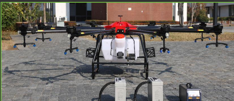
HF T72 AGRICULTURAL DRONE