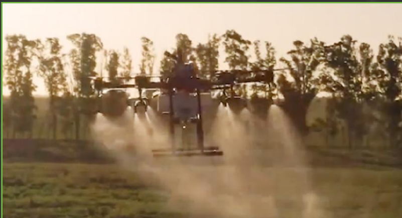
FULLY AUTONOMOUS SPRAYING