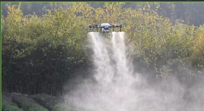
OPTIONAL CENTRIFUGAL SPRAYING