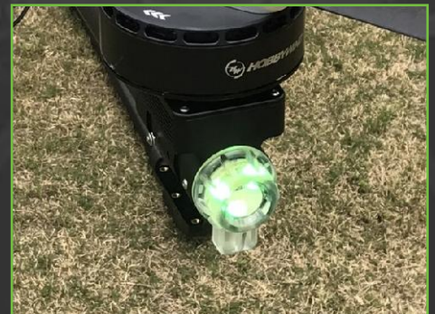
HOBBYWING X8 MOTOR