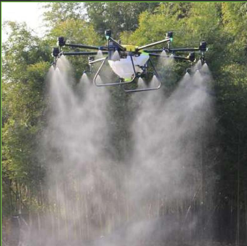
HF T52 SPRAYING MODE