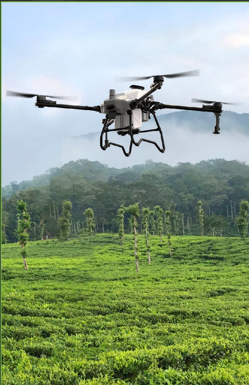
HF T65 AGRICULTURAL DRONE