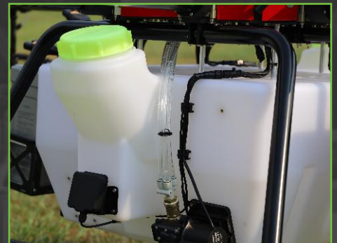
72L WATER TANK