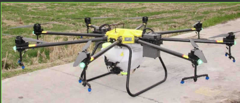
HF T52 AGRICULTURAL DRONE