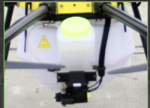
52L WATER TANK