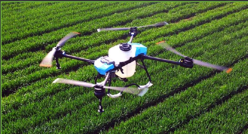
FULLY AUTONOMOUS SPRAYING