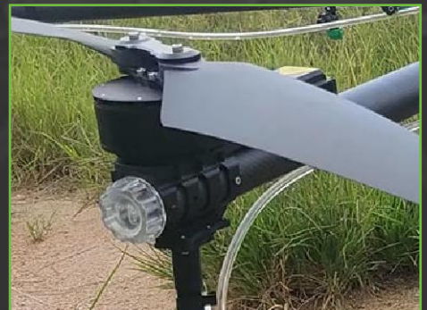
HOBBYWING X8 MOTOR