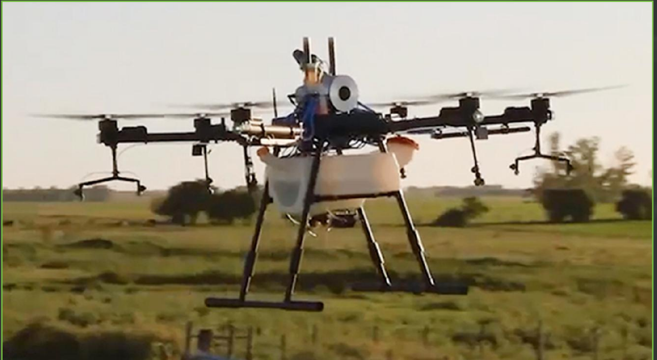
HF T60H HYBRID AGRICULTURAL DRONE