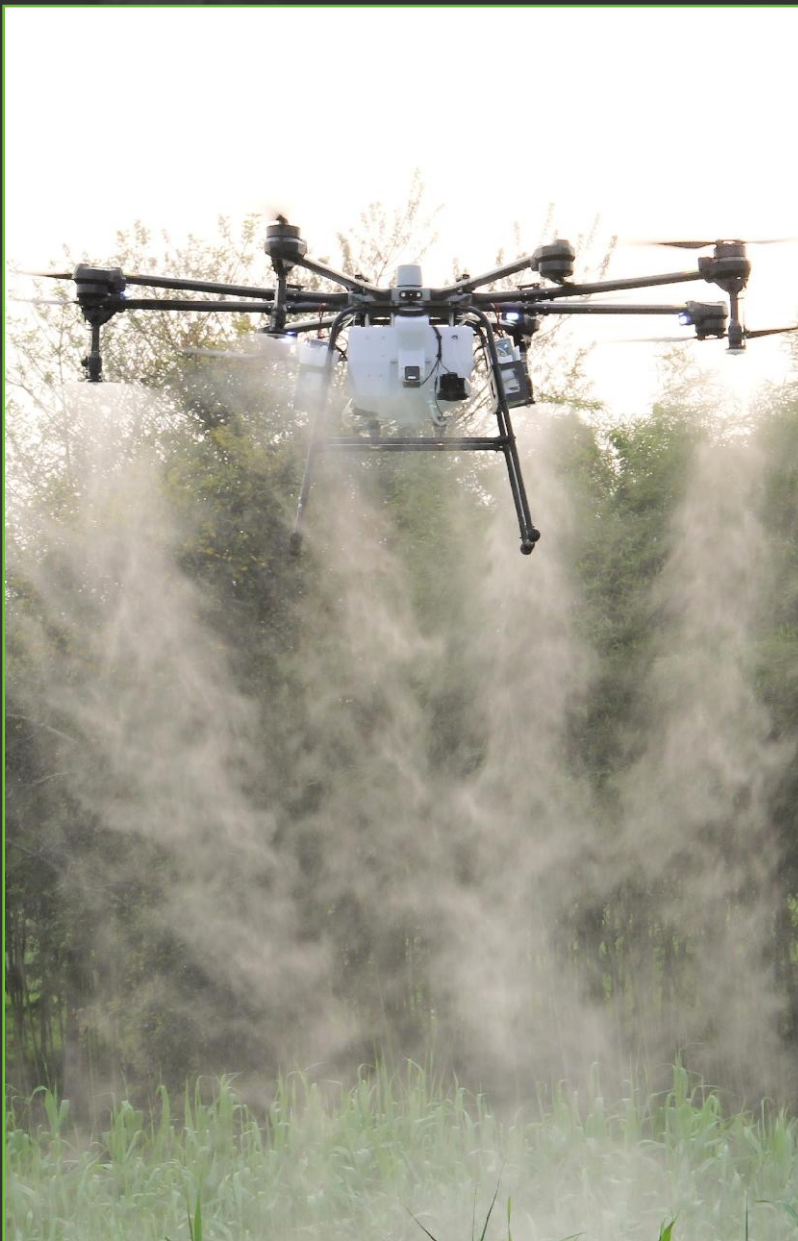
HF T92 AGRICULTURAL DRONE