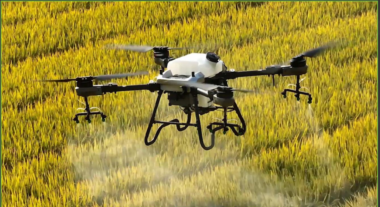
HTU T40 AGRICULTURAL DRONE