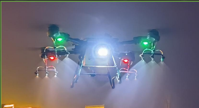
NIGHT FLIGHT FUNCTION