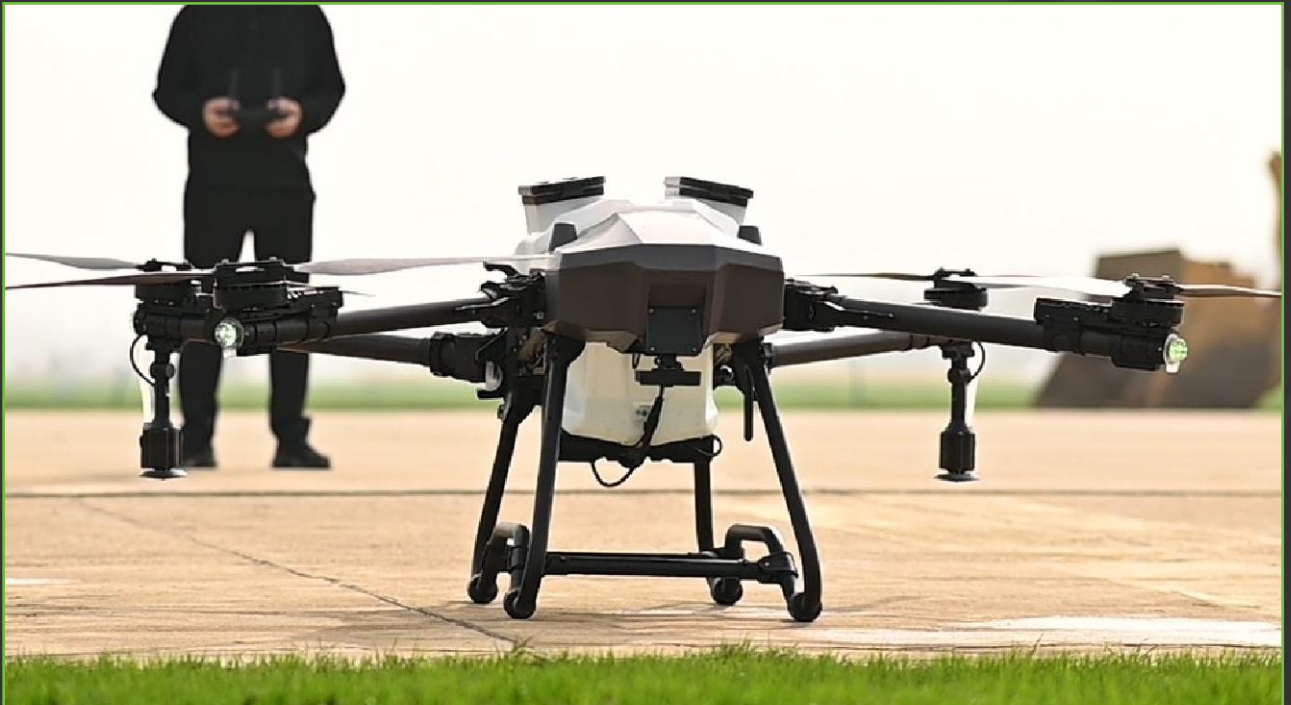
HF C50 AGRICULTURAL DRONE