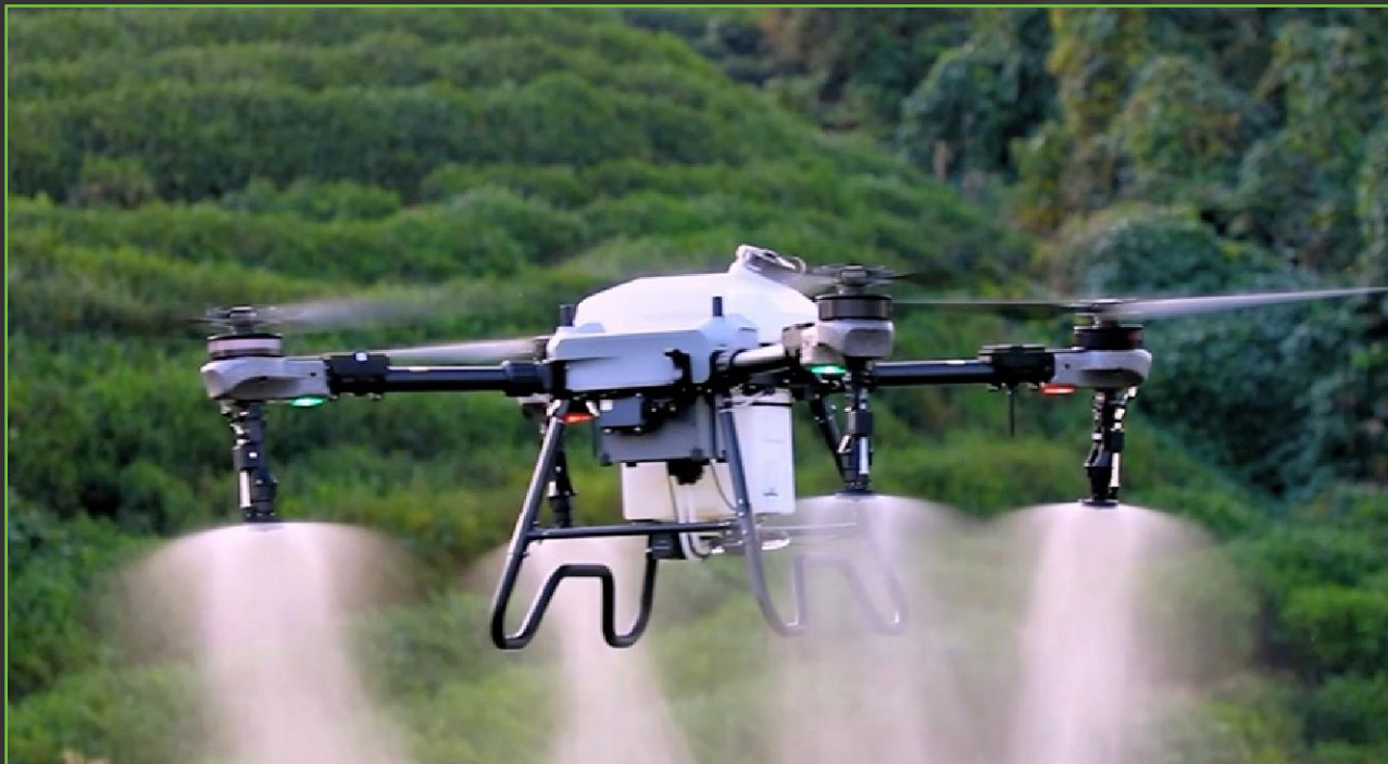
HTU T50 AGRICULTURAL DRONE