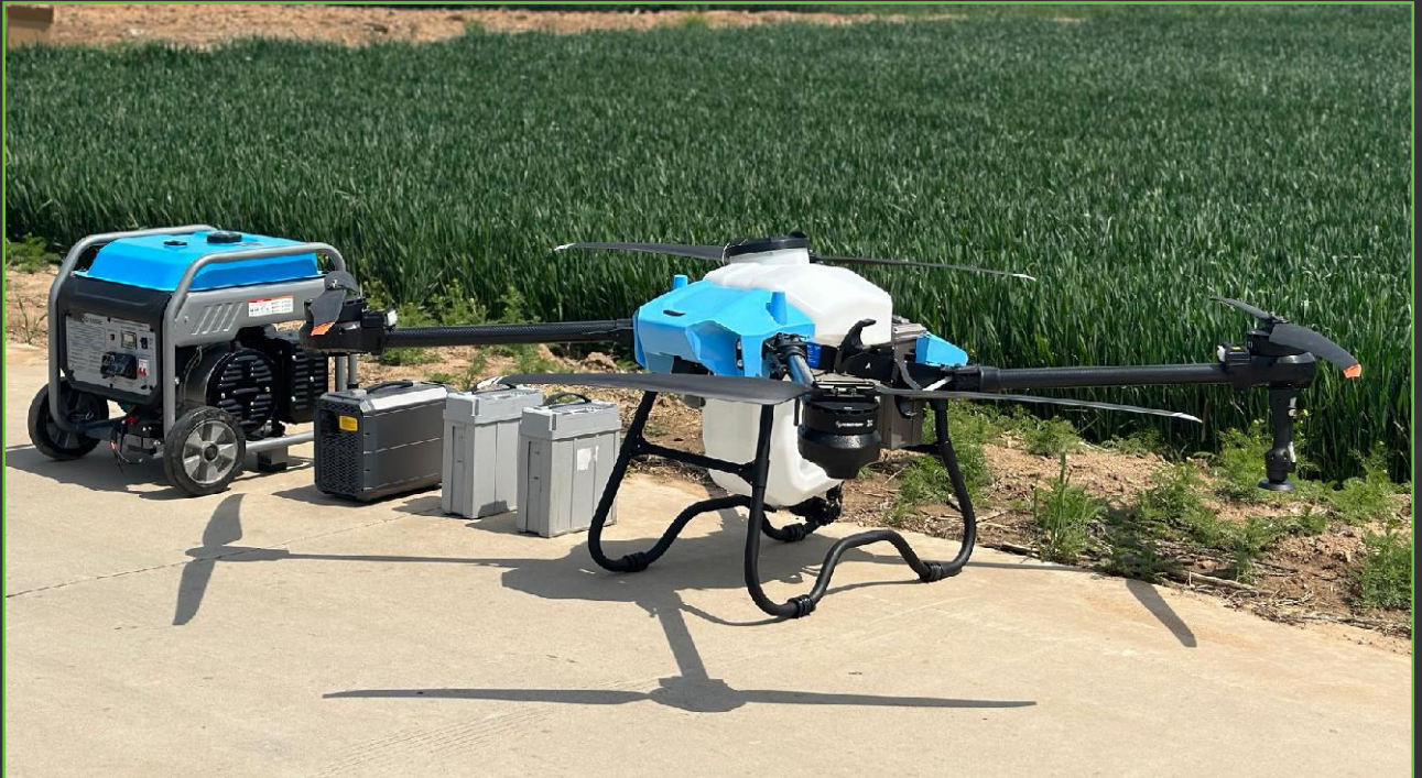
HF T60 AGRICULTURAL DRONE