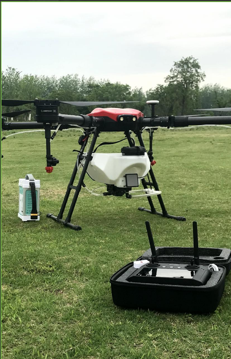
HF T10 AGRICULTURAL DRONE