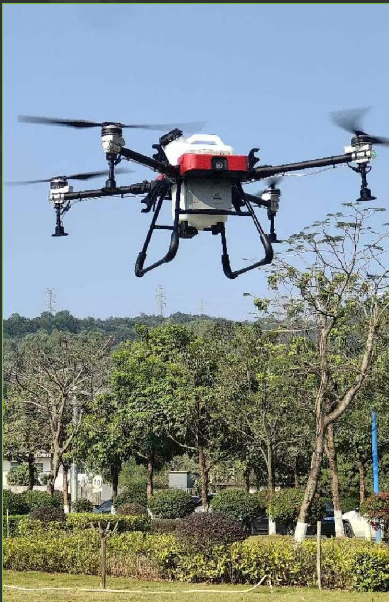
HF T30-4 AGRICULTURAL DRONE