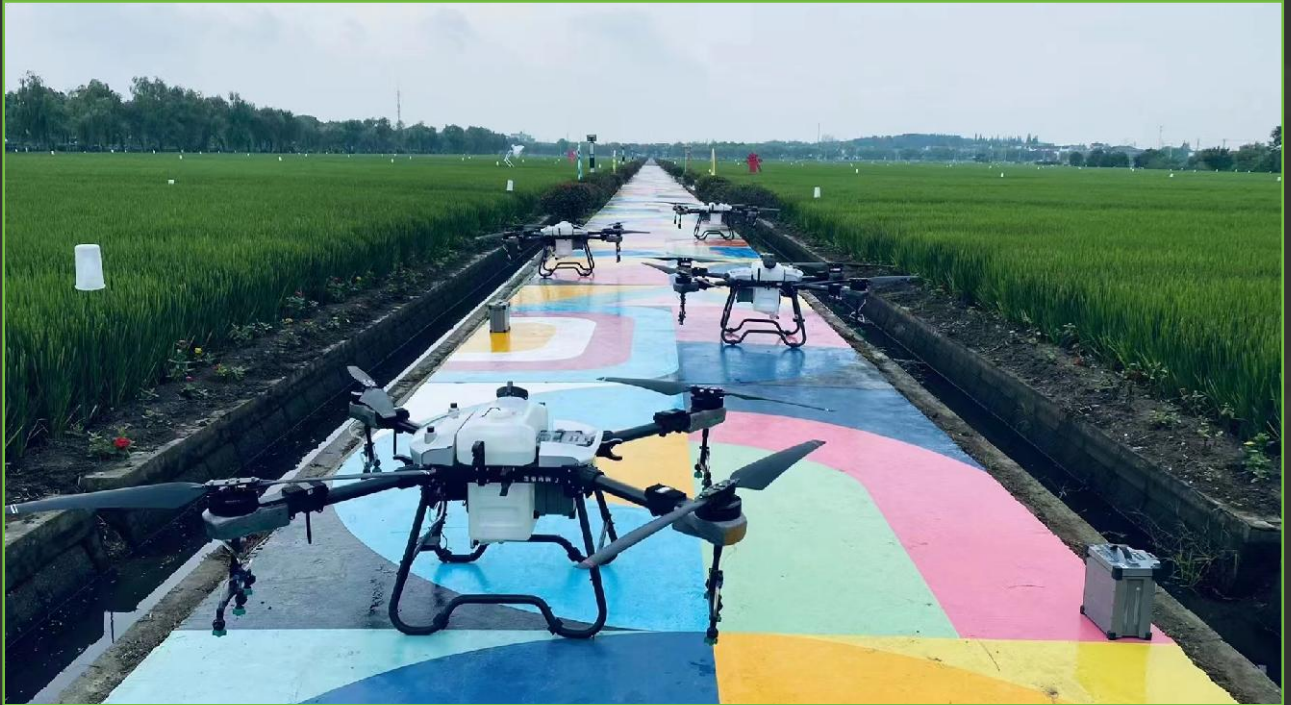
HTU T30 AGRICULTURAL DRONE