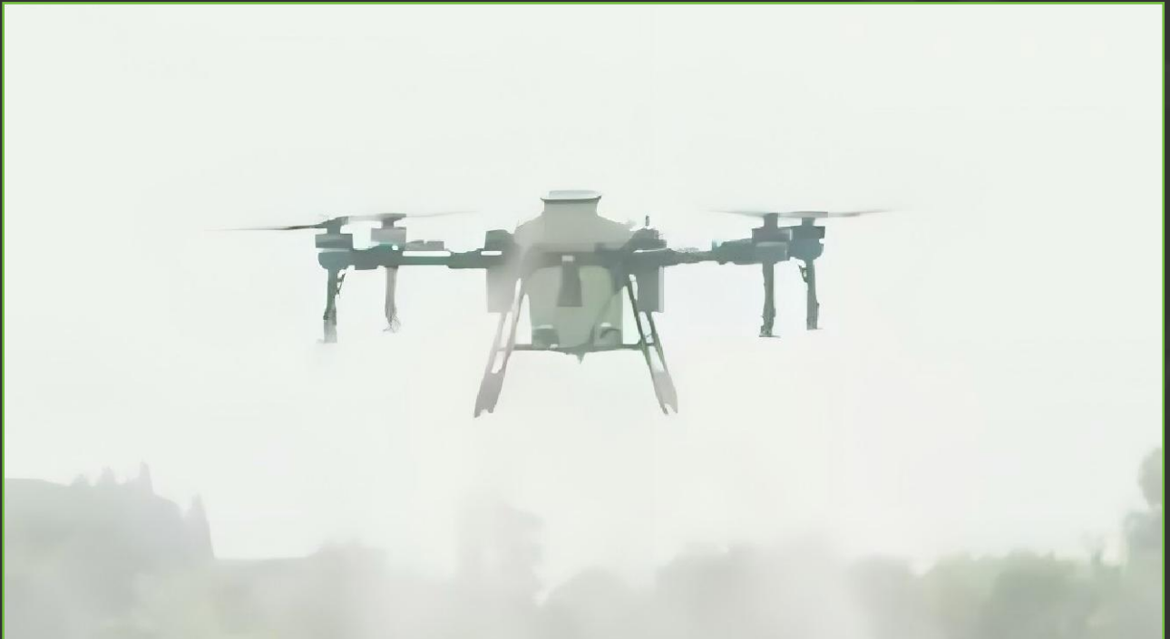
HTU T60 AGRICULTURAL DRONE