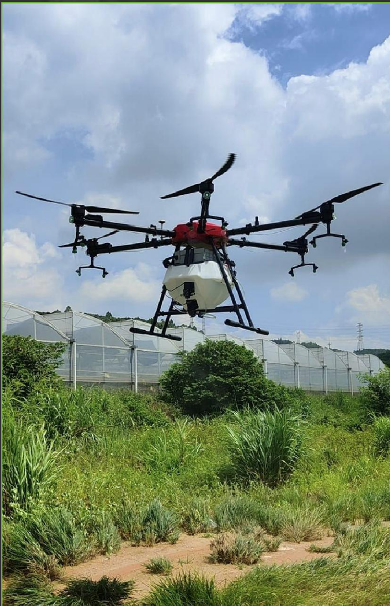
HF T20 AGRICULTURAL DRONE