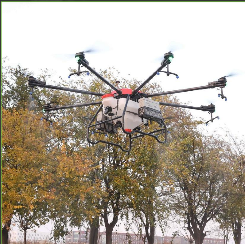
HF T72 SPRAYING MODE