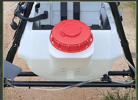
20L WATER TANK