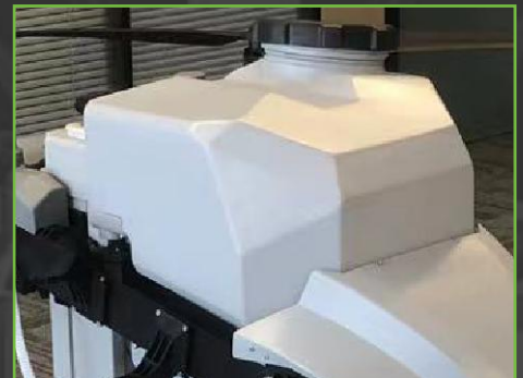
62L WATER TANK